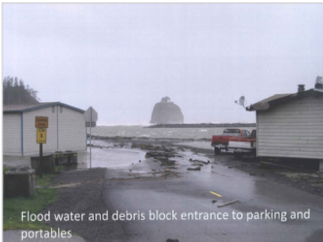
Flood water and debris block entrance to parking and portables

Crumbling unsafe buildings have resulted from the environmental conditions and do not meet building and safety health codes. The carving shed was a garage and was never intended to be used as a classroom — and it's falling down. It doesn't have a ventilation or dust collecting system, no restrooms, and has been deemed unsafe due to lack of ventilation of dust and other harmful particulates.