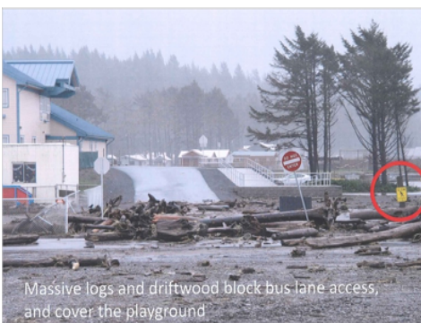
Massive logs and driftwood block bus lane access, and cover the playground

The school has five portables that house over 75 percent of the students all day, each situated only 15 feet above sea level. The location of the school causes great environmental impacts to the facilities, primarily in the form of high winds, extreme rainfall, salt air, and potential for flood, earthquake, and tsunami. In particular, the weather causes havoc to wood and metal, which rust, rot, and leak under extreme weather conditions.