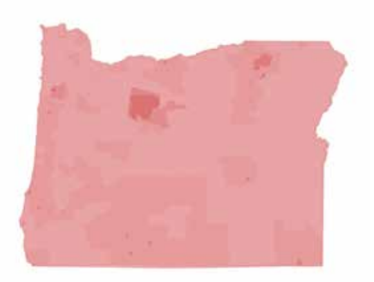
American Indian reservations and communities