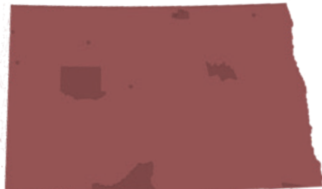
American Indian reservations and communities