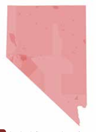
American Indian reservations and communities